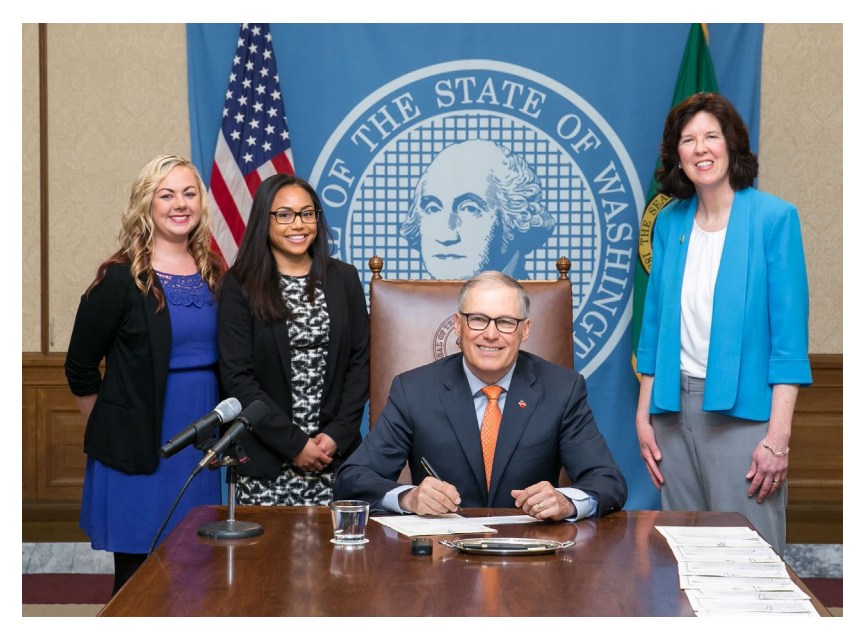
HB 1195 (Surrender/surety's bond) Bill Signing