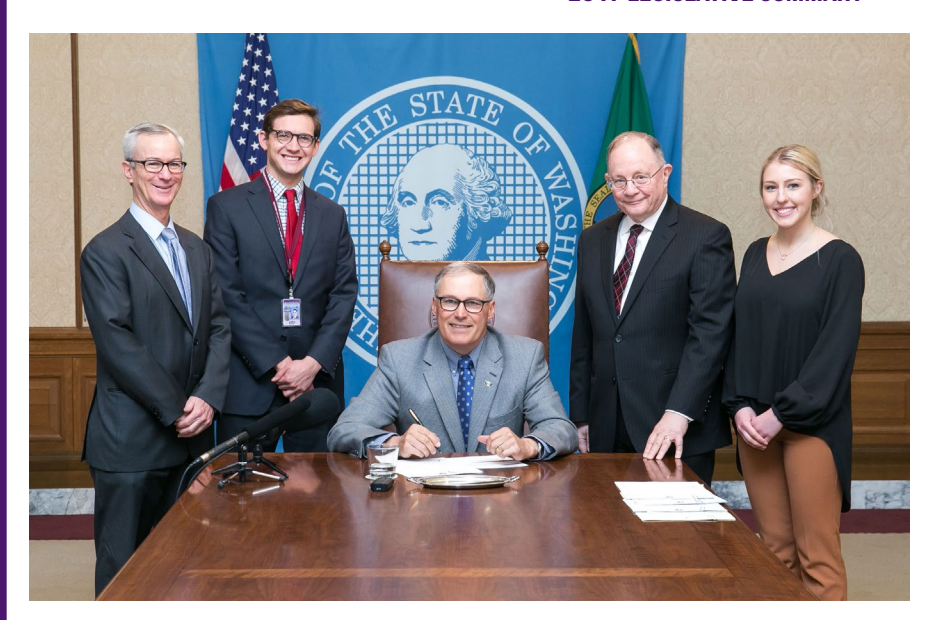
SSB 5277 (Disqualification of judges) Bill Signing