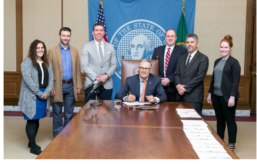
HB 1285 (Legal interpreters/oaths) Bill Signing

Authorizes a permanent oath for AOC and Office of Deaf and Hard of Hearing-credentialed court interpreters. This will reduce the number of times judges or notaries working in the courts across our state will be involved in oath administration actions with credentialed interpreters.