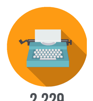
Bills introduced and screened

As you read through these summaries, please don't hesitate to reach out if you have questions. You can also find detailed information about a bill on the Legislature's website by visiting <a href="http://app.leg.wa.gov/billinfo/">http://app.leg.wa.gov/billinfo/</a> and entering the 4-digit bill number.