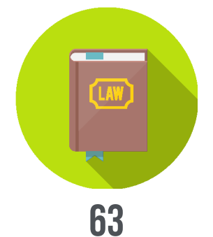
Enacted bills with court impact